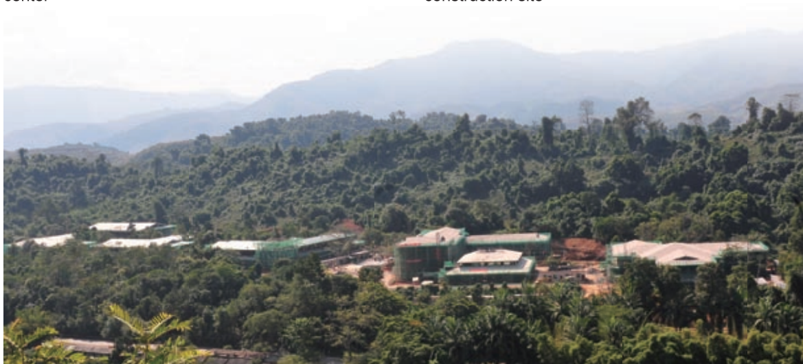
A bird's-eye view of the constructing new research center