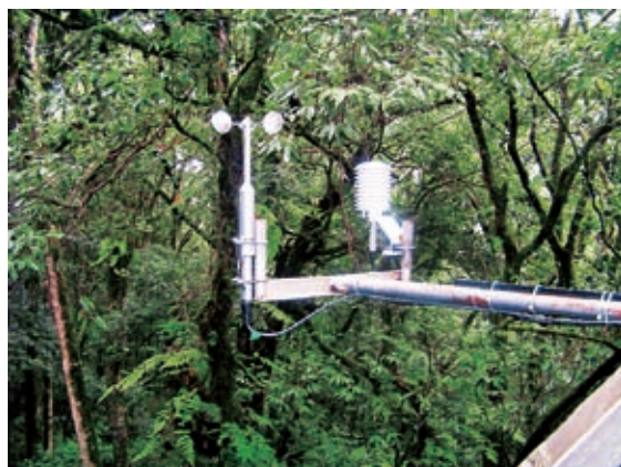
Seven-level wind speed, temperature and humid microclimate vertical observatory system and 6-level pole PAR observatory system

A 30 m high observation tower for subtropical montane evergreen broad-leaved forest was set up in Ailaoshan National Nature Reserve by XTBG, located at 24^{\circ}32'17''\text{N} , 101^{\circ}01'44''\text{E} , 2505m a s l. Seven levels of RMET system and one level of OPEC system are fixed on the tower at different platforms. Meanwhile, chamber measurement system is also installed. The typical vegetation in the Ailaoshan National Nature Reserve is represented by subtropical montane evergreen broad-leaved forest with a canopy height of 23m.