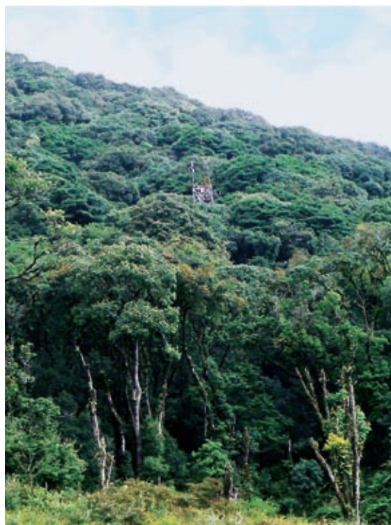
Physiognomy of subtropical montane evergreen broad leaved forest and the 30m high flux observation tower in Ailao Mt.