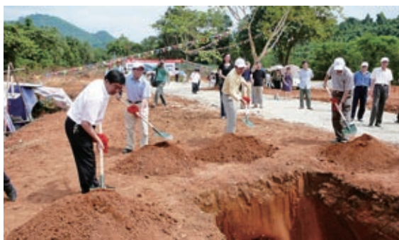
Ground-breaking ceremony of the new research center