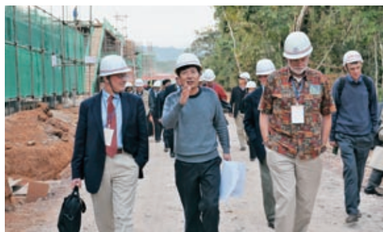
Twenty-four world's leading scientists inspecting the construction site