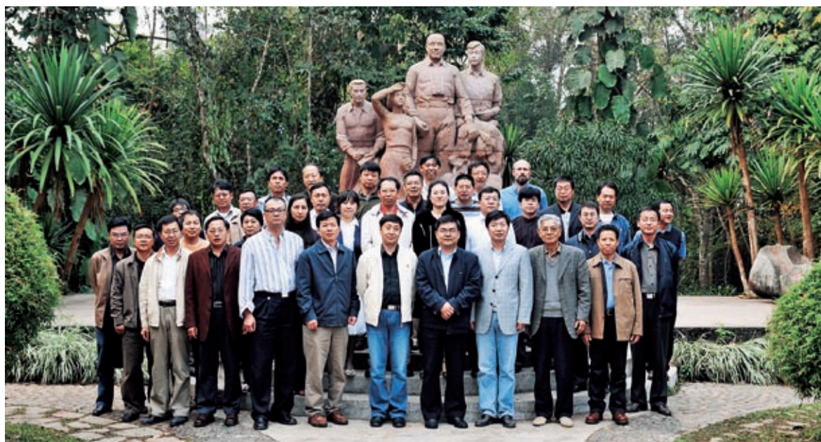
Participants of the first academic symposium of the CAS key lab of tropical forest ecology