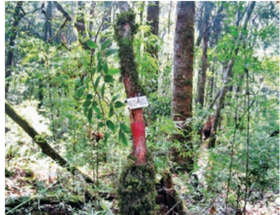
Inside view of 6-ha subtropical forest dynamics plot

The functions of the plot are for investigating plant ecological resources, identifying trees with DBH \geq 1cm, determining diameters at breast height (DBH), positioning trees, and mapping tree distribution patterns, etc. By using the scientific facilities of XTBG Ailaoshan