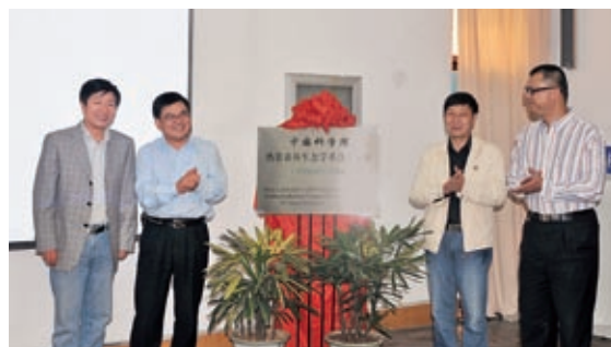
The unveiling of the CAS key lab plaque on the opening ceremony