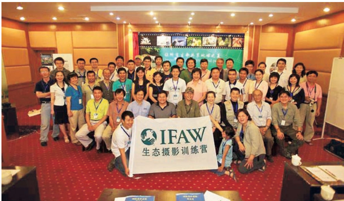
Participants of IFAW eco-photography training camp

China has rich biodiversity in the world. However, images of some rare endangered species are relatively lacked. While improving the level of ecological photographing, the photographers are to contribute to environmental protection through the power of images.