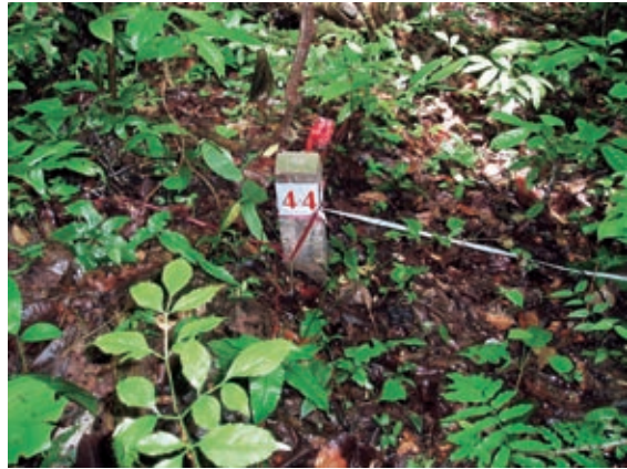
One of the subplot marking stakes in the plot

Follow the criteria set by the Center for Tropical Forest Science (CTFS), researchers found out that 468 species of trees, including 95,843 individuals with DBH \geq 1\text{cm} . The data regarding this plot was published by Yunnan Science & Technology Press.