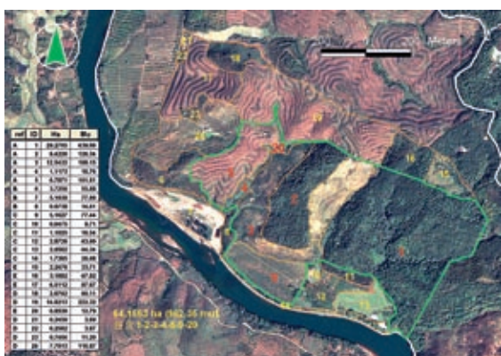
Satellite image of the 64-hectare experiment base

The escalating economic growth and impacts of human activities have resulted in the tremendous changes of natural ecosystems. It has become an important mission for long-term ecological studies to understand response mechanisms of ecosystems to global change at multiple scales. Ecological modeling experiment based on artificial control seems to be an effective option. XTBG has set up a 64-hectare experiment base, within the garden, for controlled ecological experiments and to demonstrate techniques in tropical vegetation restoration.