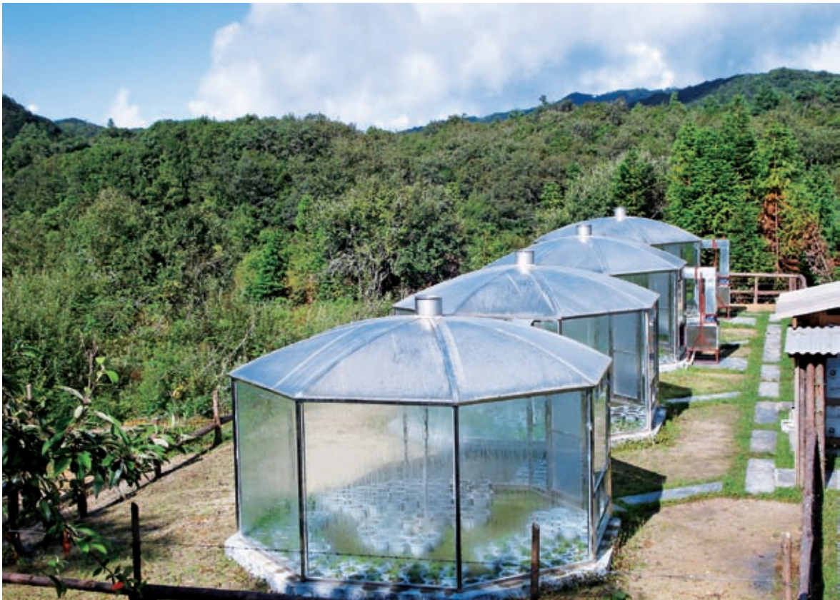
The CO 2 phytotrons

countermeasures are to be formulated in a bid to stop their propagation and develop new methods of scientific management for their control and prevention. By using the phytotron, scientists can predict the possible distribution of invaded plant species, discover the vulnerable spots and limiting factors, and make an early warning,